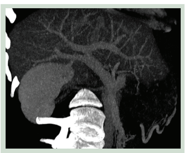
Figure 5. MIP image on coronal oblique plane in a 21-year-old male patient demonstrates the common trunk of the right anterior portal vein and left portal vein (Type III).