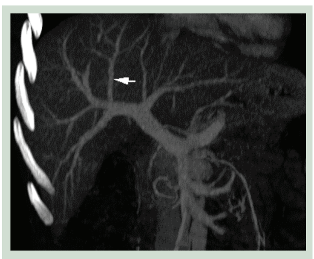
Figure 6. A 35-year-old female patient. MIP image on coronal plane demonstrates an accessory segment VIII vein originating from the right portal vein.