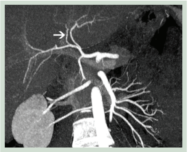
Figure 2. A 32-year-old male patient. MIP image on coronal oblique plane. Segment IV artery originated from right hepatic artery.