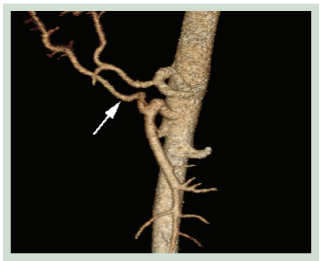
Figure 1. A 39-year-old female patient. Replaced right hepatic artery originating from SMA (type III). 3D VR image on coronal plane.