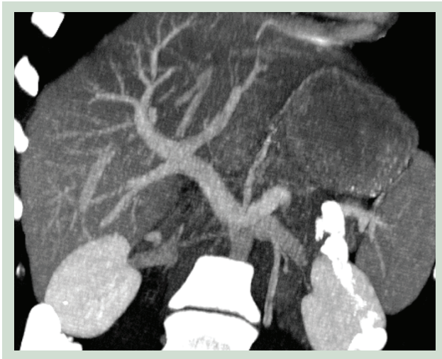
Figure 4. An 18-year-old male patient. MIP image on coronal oblique plane demonstrates the trifurcation of the right anterior portal vein, right posterior portal vein and left portal vein branches (Type II).